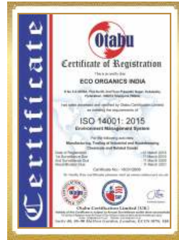
ISO 14001 : 2015