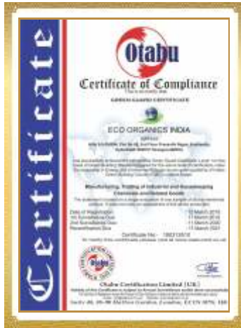
Green Guard Certificate